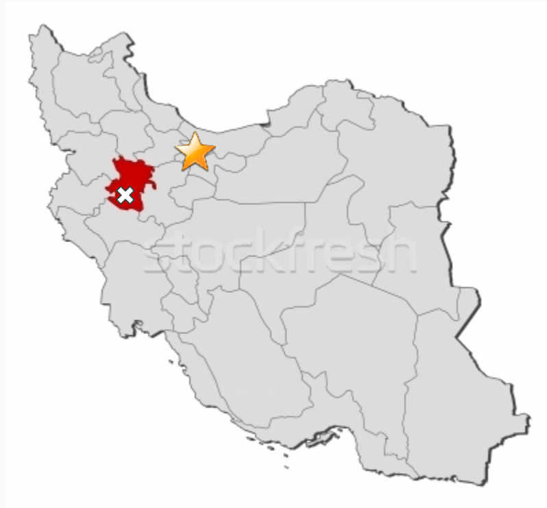
Present Day Location of Ecbatana, in Hamadan Province, Iran, in the Zagros Mountains