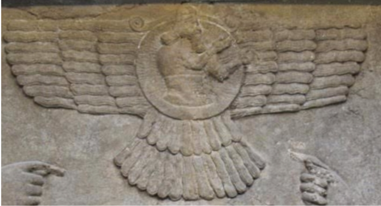
An image of Ashur found in the Assyrian Exhibit of the British Museum Originally found in the palace of an Assyrian King who reigned in the 800s BCE