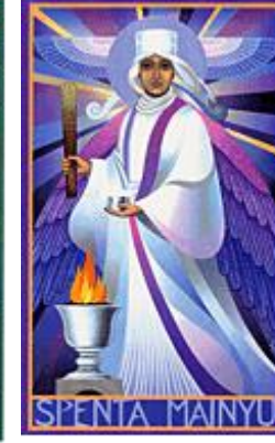
Holy Creative Spirit: Human Beings

Unfortunately we have been told that Amesha Spentas are Angels, they are Bountiful Immortals, they are divinities and attributes of God, every translator has personified them and even pictures have been drawn.