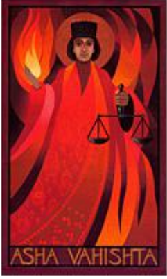
Truth and Justice: Fire