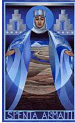
Holy Serenity, Devotion: The Earth