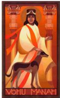
Good Mind, Intelligence: Animals