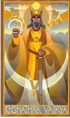
Righteous Power: The Sky, Metals